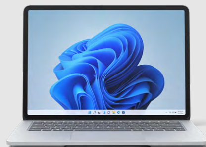
Surface Laptop Studio