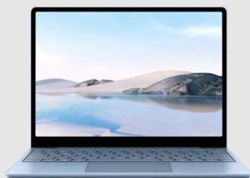
Surface Laptop Go

And healthcare leaders will be empowered to maximise the capacity of existing clinical teams while safeguarding their wellbeing.