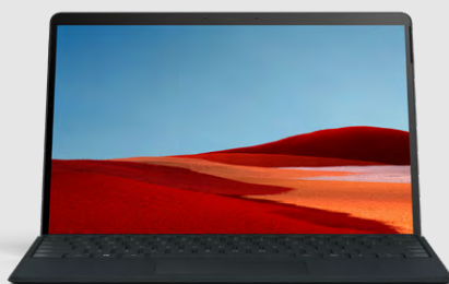
Surface Pro X